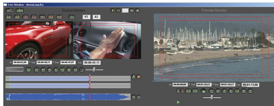
The Trim Window set to show the in-point and out-point frames of the source clip. Note the source clip audio waveform display, a feature not found in many other NLE trim windows.

VelocityHD is a "dual-track" or "A-x-B track" editor at heart. It's based on using separate tracks for the A-